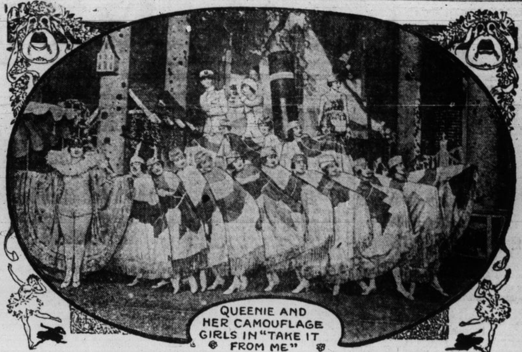
HITS FROM "TAKE IT FROM ME"—ONE SOLID YEAR IN NEW YORK. Call of the Cozy Little Home—Linger in the Lingerie—Take It From Me—To Have and To Hold—Camouflage—The Kiss—To-morrow—The Tanglefoot. La test hits from all the 1920 New York Musical Successes.

The College Book Store Telephone 919 Open Evenings