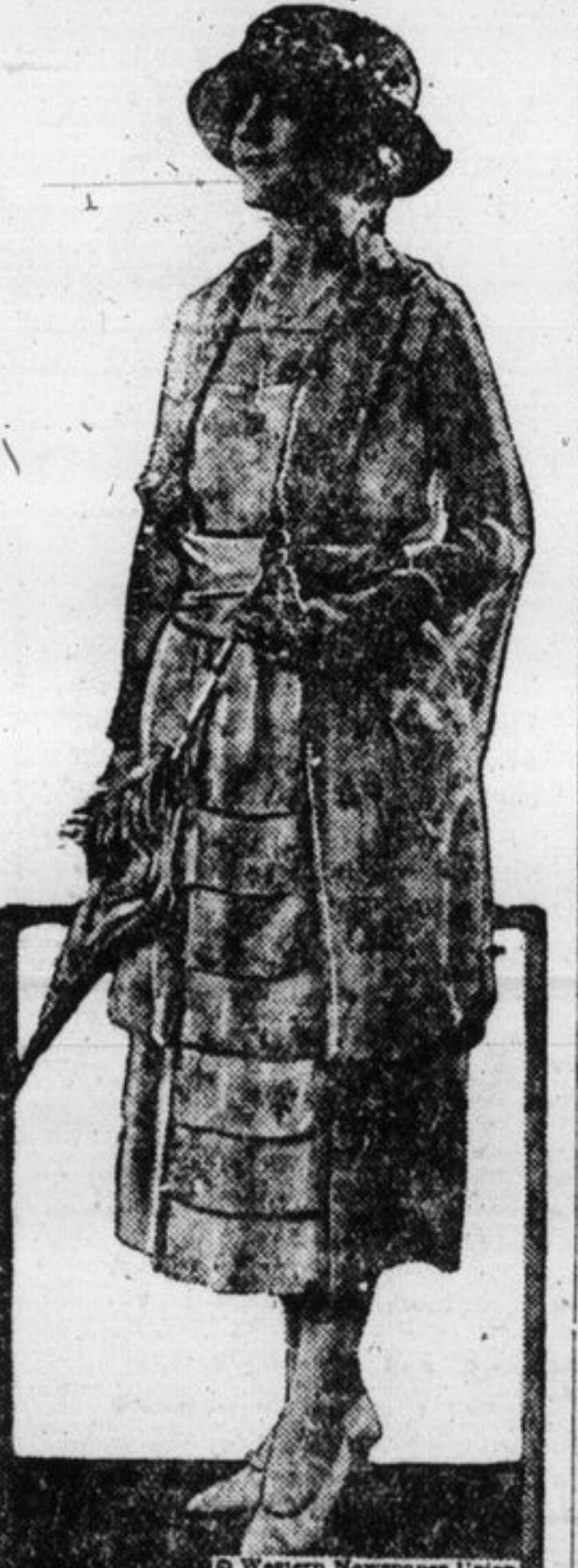
Flowered chiffon bids fair to play an important part in midday's summer wardrobe. Here is a puff-and-frill combination of the most exquisite daintiness, in this fetching gown for the young miss.