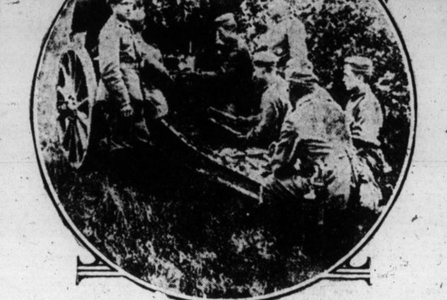
At the top left is shown a group of future field marshals of the new German army, mapping out a mock campaign.

When the races are run off at the fair grounds on Monday, July 26th, Old Boys' Day, the spectators will have an opportunity of seeing a competitor in the 2.10 class.