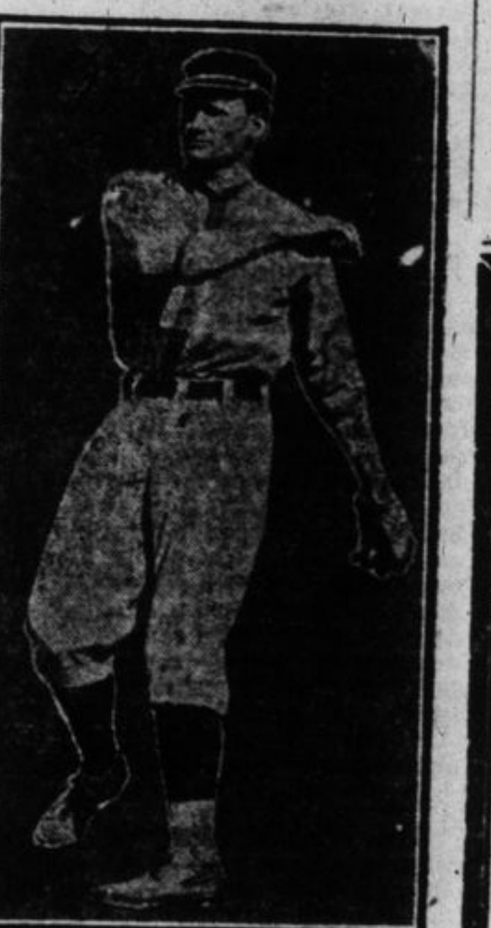
HIS FIRST NO-HIT GAME. Walter Johnson, pitcher of the Washington team, pitched the first no-hit game of his fourteen years in the major league on July 1.