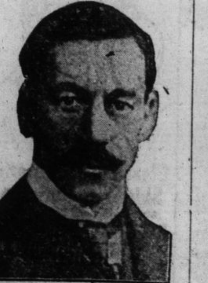
WILLIAM SAMUEL AMNESTY. Sir Herbert Samuel, who will celebrate his assumption of the high commission of Palestine, by granting a general amnesty to all persons convicted of rioting in Jerusalem.