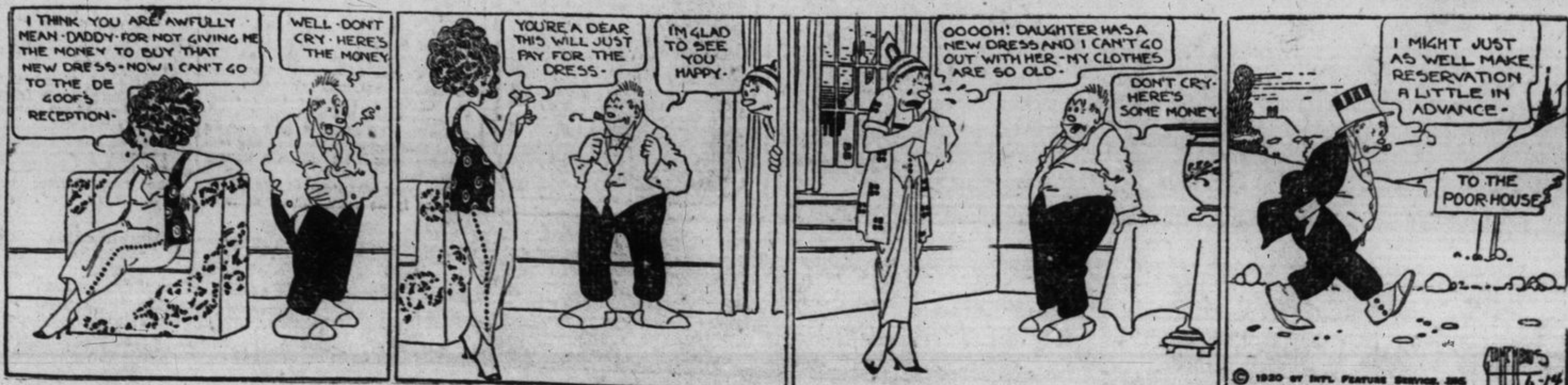
By GEORGE McMANUS