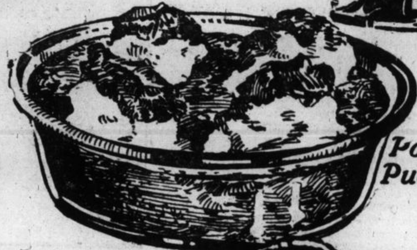
Poor Man's Pudding!

More than mere "sweetening" is LANTIC Brown Sugar—it's a luscious flavour! Pure as LANTIC Fine Granulated, this exquisite and health-giving product of the sun-flooded tropics has in each tiny particle the rich syrupy "bouquet" of the sugar cane.