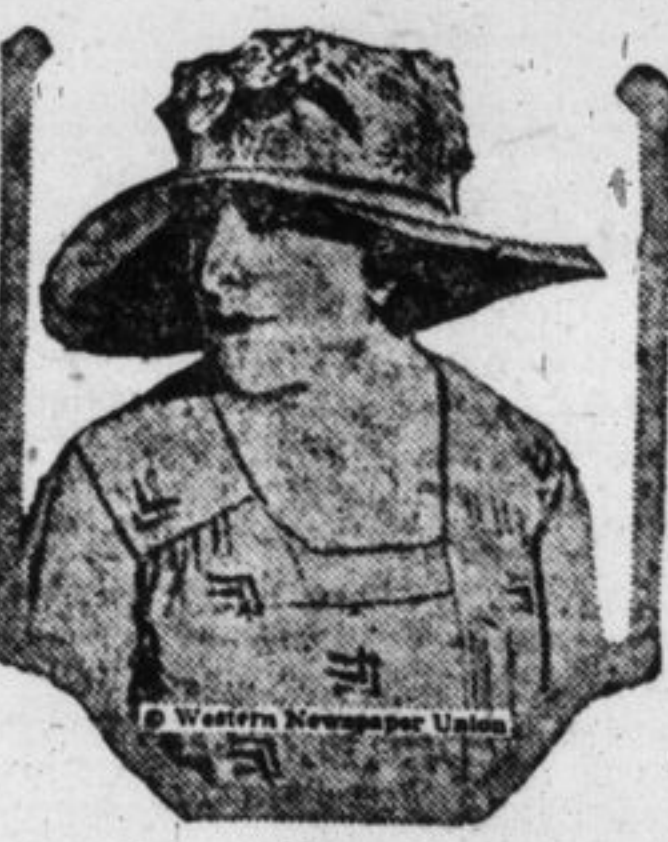
Hat of Milan Straw.

Ribbons especially have come into a glorified success, as a hat adornment this season. Entire turbans and brimmed hats are made of narrow ribbons woven together like those paper mats of kindergarten days. Wide brimmed horse hair hats have immense sashes of wider pastel-tinted