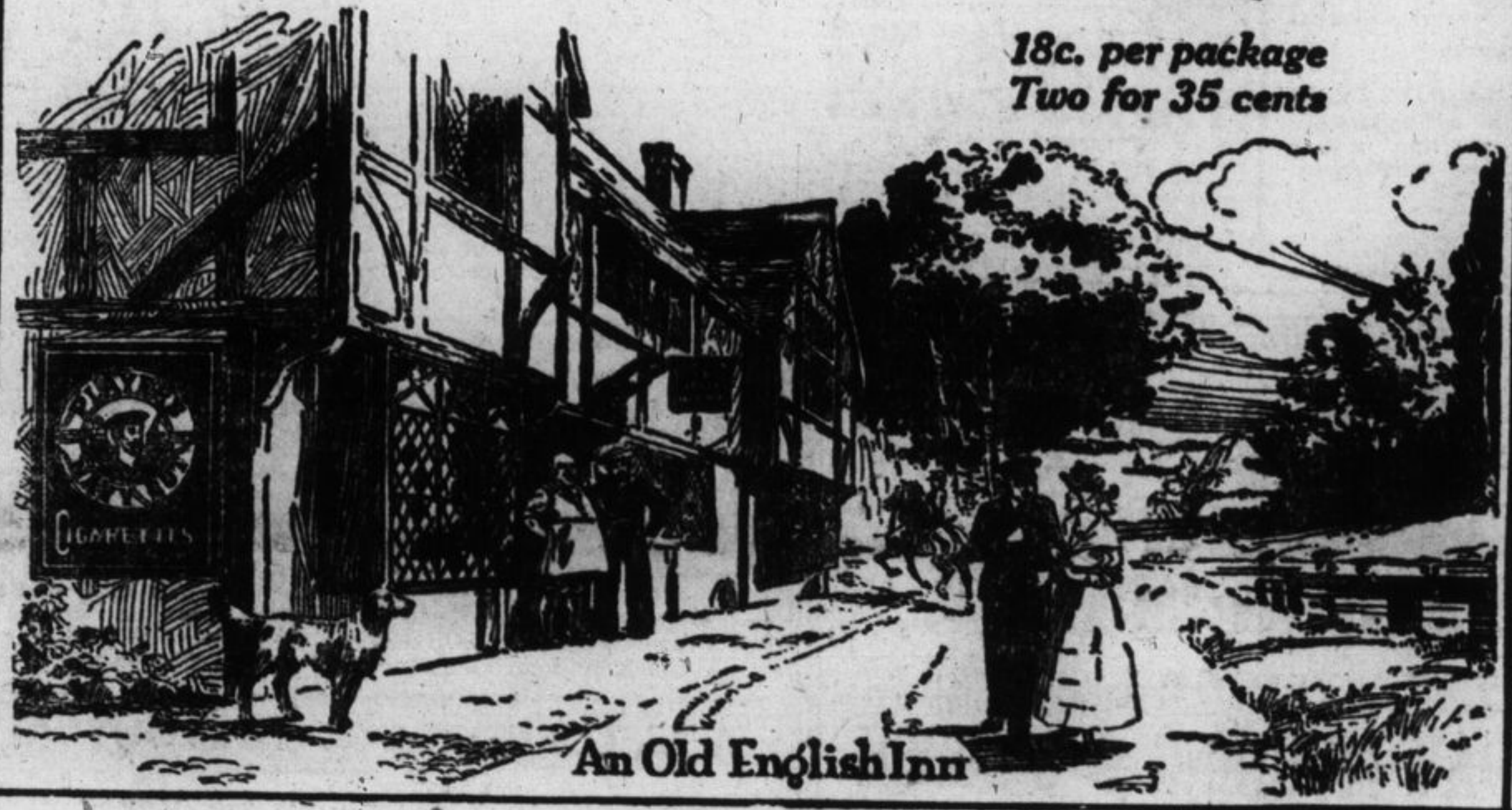
An Old English Inn