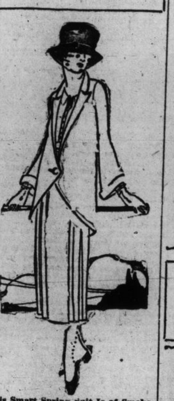
This Smart Spring suit is of Smoke-Gray Tricotine.

Smoke Gray tricotine is an exceedingly popular fabric for the spring suit. Cut in severely tailored lines this model of gray tricotine is given that "touch unusual" by long revers and a single button fastening that accents the cutaway line of the front. The skirt is pleated. Pleated skirts are so popular that they might almost be said to be universal. The sewed-in sleeves flare at the slightly abbreviated wristline and are finished with a turn-back cuff. Worn with a black hat, a white linen blouse and a tiny black tie this suit completes a charming ensemble.