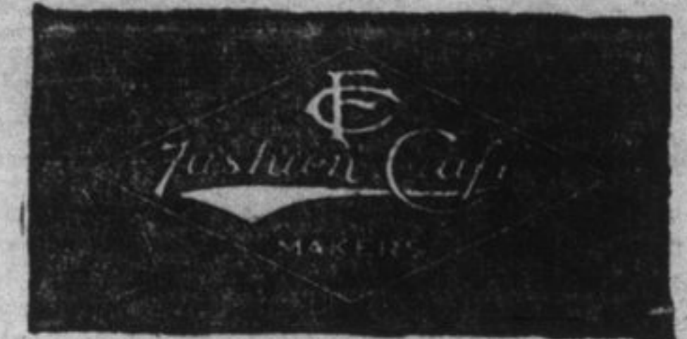
FACSIMILE OF LABEL

Every suit is tailored in the best possible way and bears a label showing by whom made.