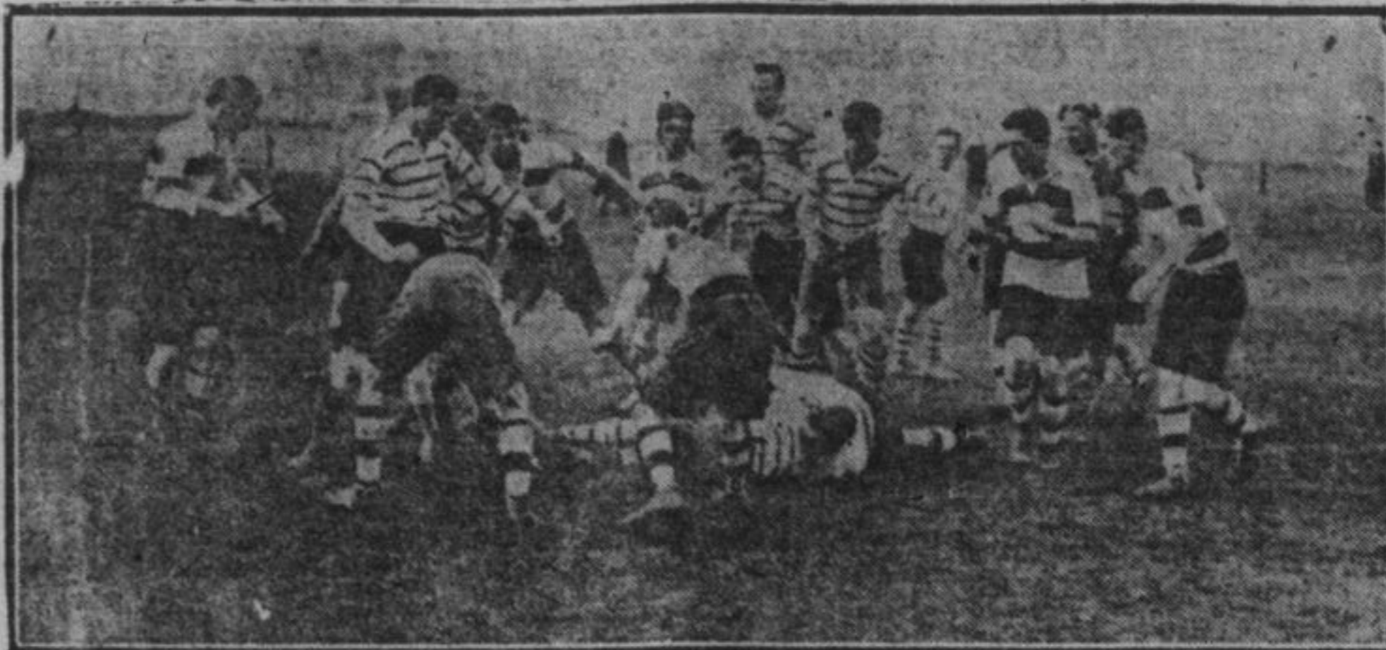
A Middlesex man, though well tackled, manages to make a successful pass. St. Barts met Middlesex in the Hospital Cup competition.