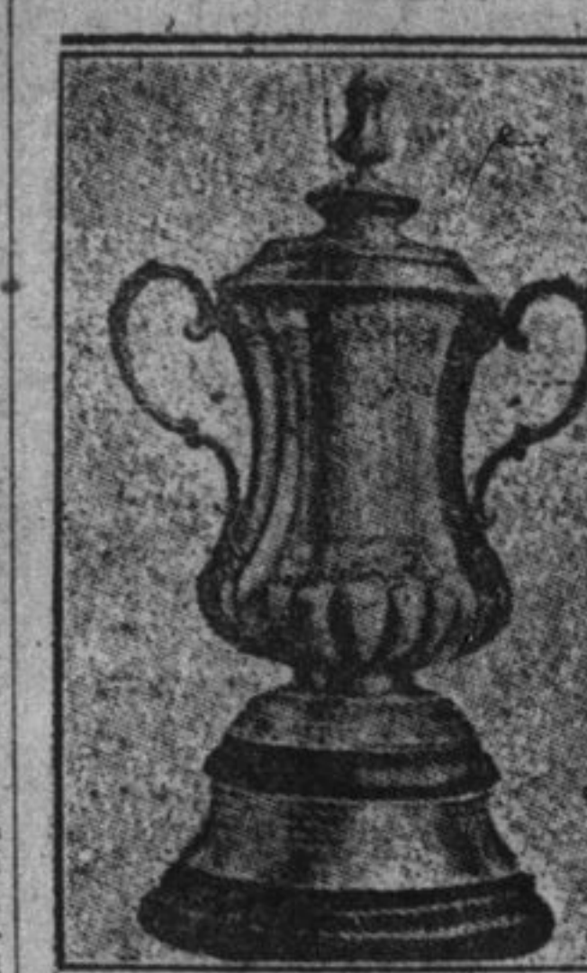
THE ENGLISH CUP Worth only £75, but fought for by the cream of the association football world. Gold cup worth £500 was refused by the football association.

A story which originated in Boston that Babe Ruth would not accompany the Yankees south unless given $15,000 of the purchase money apparently is without foundation.