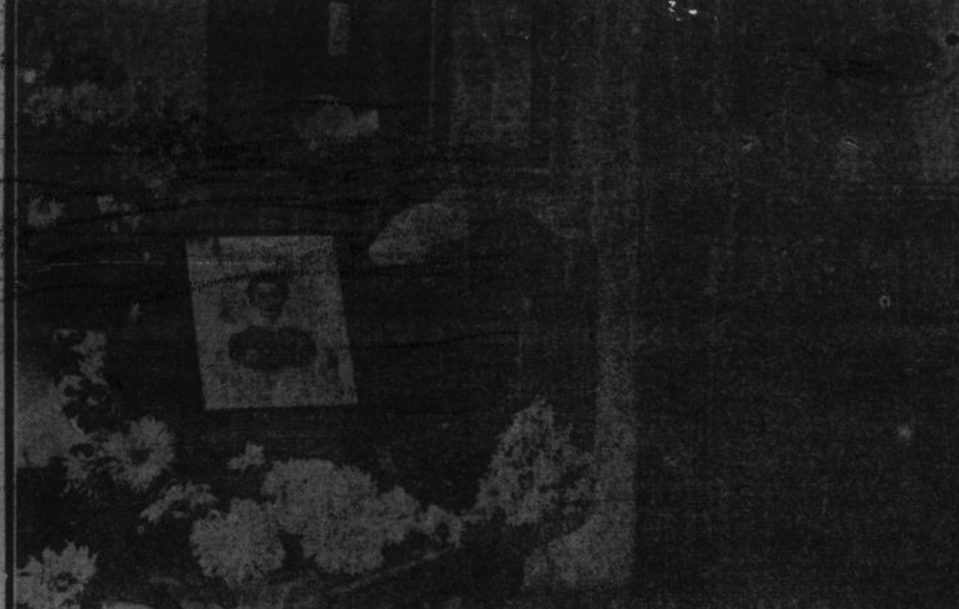
The cell in the St. Gilles prison, near Brussels, occupied by Edith Cavell just before being shot by the Germans, is now a museum, sacred to her memory. On the table is her picture, surrounded by flowers. In the small cupboard on the wall are the drinking cup and pewter dish used by the heroine nurse during her imprisonment, awaiting death.