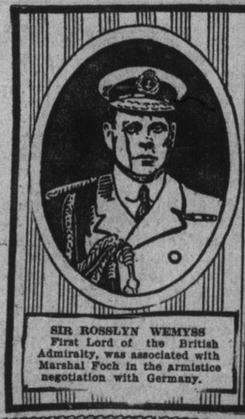
SIR ROSSLYN WEMYSS First Lord of the British Admiralty, was associated with Marshal Foch in the armistice negotiation with Germany.