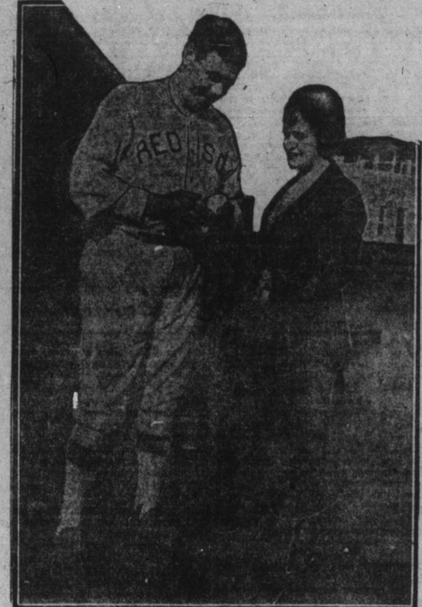
"BABE" RUTH, BASEBALL'S GREATEST ATTRACTION. George H. ("Babe") Ruth, home-run king, photographed in Los Angeles, Cal. Showing his wife how to hold a baseball when pitching. The New York Americans bought Ruth from the Boston Red Sox for the reported sum of $120,000, the largest price ever paid for a baseball player, and it is said Ruth will get $20,000 a year.

Hugh Jennings will take eight recruit pitchers and six veteran slabbers to the Macon training camp.