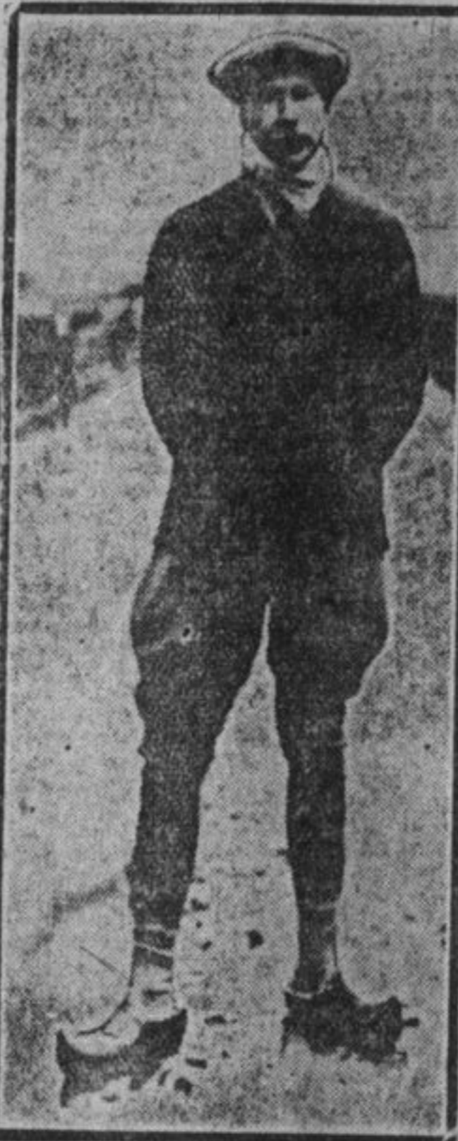
WILL HOLLAND GIVE HIM TO THE