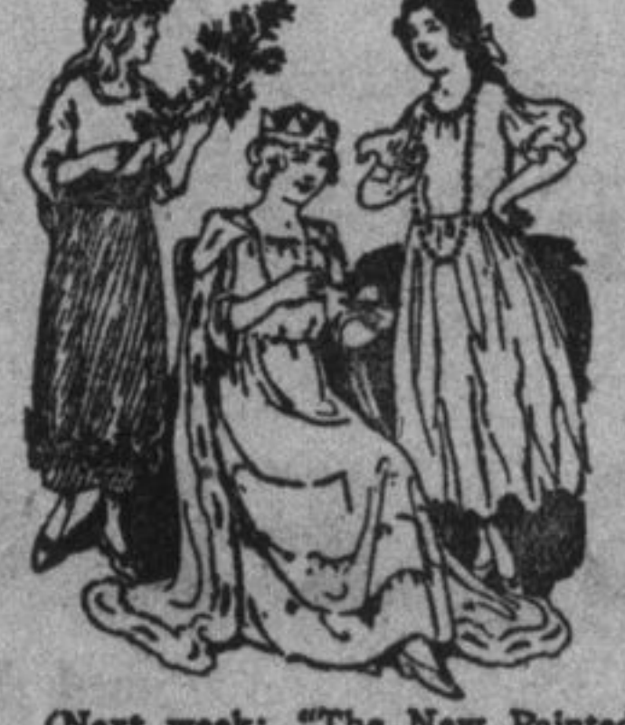
(Next week: "The New Painted Furniture." Boys and Girls' Newspaper Service Copyright, 1919, by J. H. Miller)

The Spirit of the Hearth This is for the dark haired girl who can wear flame color. Cover an old red dress with crimson tulle or the red tulle on sale at holiday time. The covering should be full enough so that it will move like the fire it represents, and a painted border of yellow will give it the appearance of flames. A long string of black wooden beads typifies the coals of the hearth. Use the big, wooden kindergarten beads, staining them black. And do make yourself a cricket to perch on your shoulder. His body is cotton batting, covered with black crepe paper, and his legs are hat wire, wound with black silk and bent into shape.