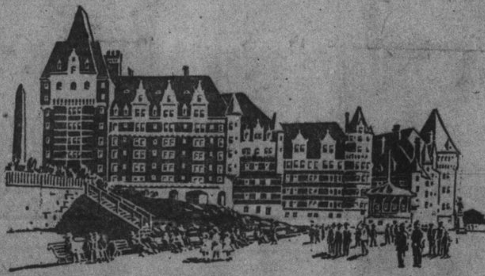
CHATEAU FRONTENAC - QUEBEC

The Dominion Express Company, operating on all lines of the Canadian Pacific Railway, Canadian Pacific Ocean Services, and other railway and steamship services, forwards merchandise, money, valuables, etc., to all parts of the world, promptly, carefully and at reasonable rates. Money orders, foreign cheques and travellers cheques issued.