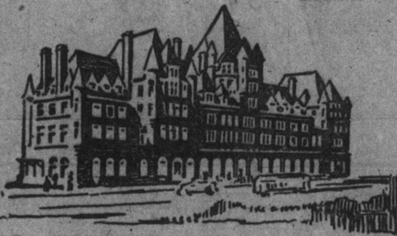
PLACE VIGER - MONTREAL