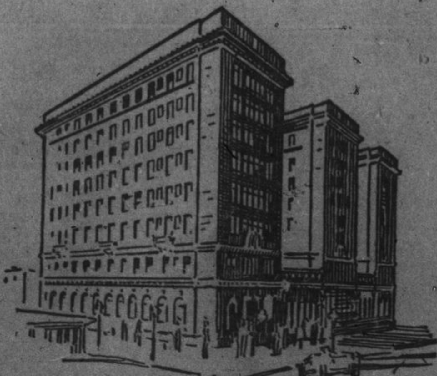
PALLISER - CALGARY