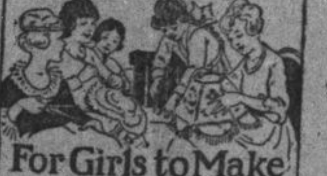
For Girls to Make