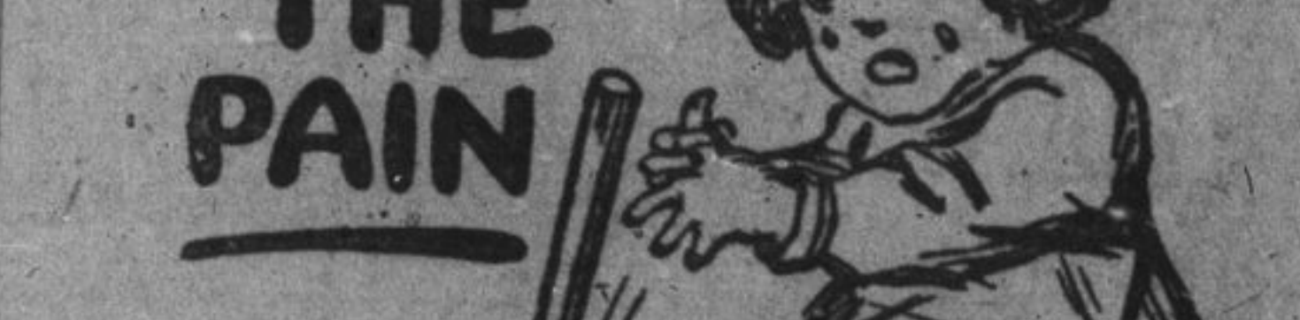
Children who have once had Zam-Buk applied, cry for it when hurt.

Not only in the home, but in the office, store and factory, Zam-Buk should be kept handy to apply immediately an injury is sustained.