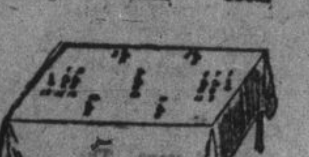
make them stand up, mould some feet for them of putty or gum.