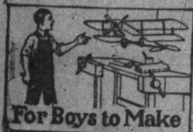
For Boys to Make