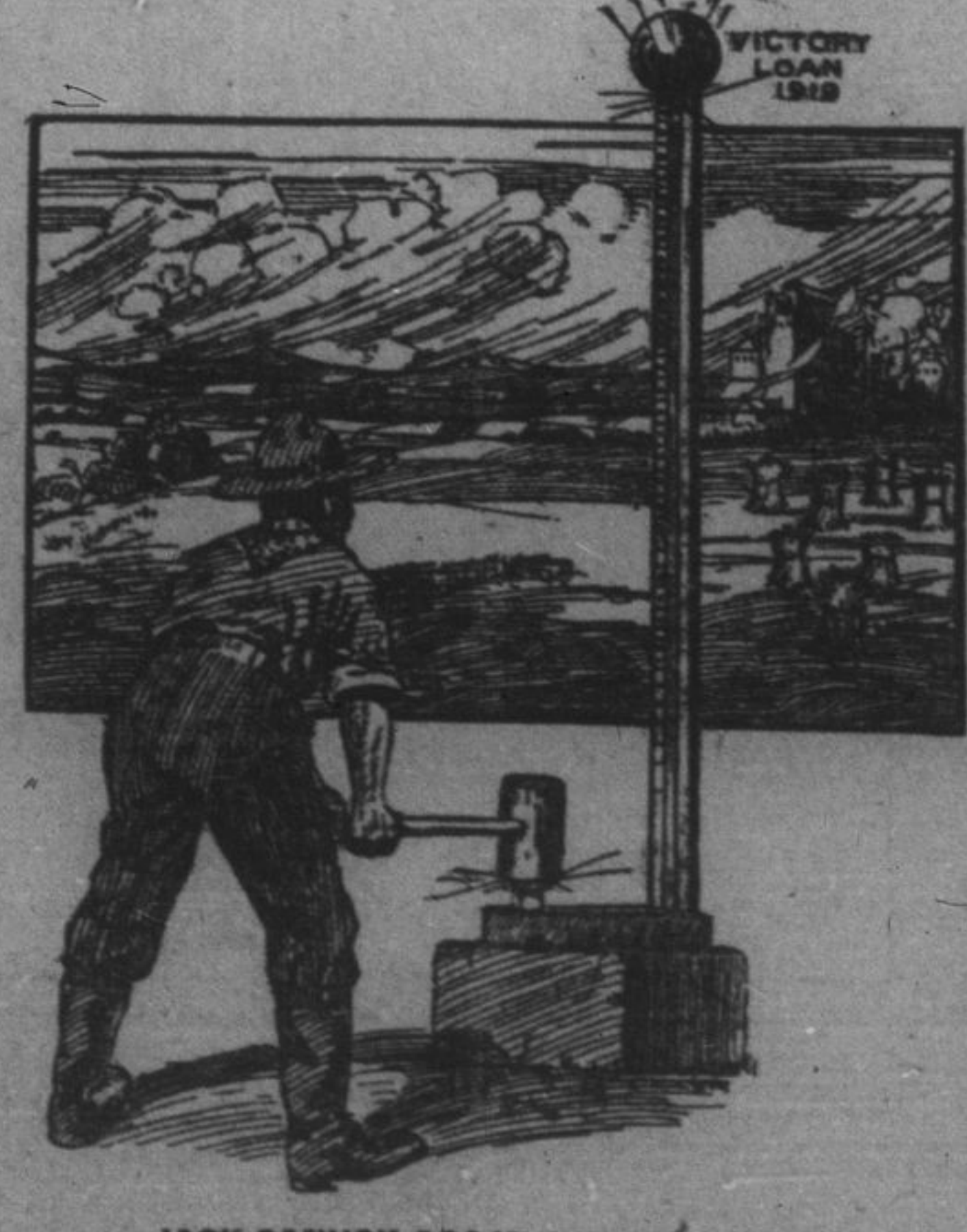
JACK DANUCK AGAIN RINGS THE BELL.

Your country needs you! A war-time cry, but it holds good now. Your country DOES need you. It needs your support. You can best serve Canada by—