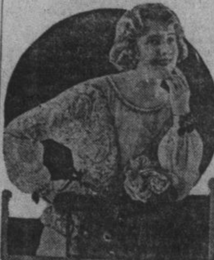
Navy Figured White Georgette Gives Us This Dainty Blouse of Exquisite Charm for Miss 1919's Summer Wardrobe.

Dainty Frills of Lawn. One or two-inch frills of lawn either hemmed or used in a double thickness is one of the daintiest trappings that can be used on fluffy wash summer frocks. On the organdies so good right now, volles and gingham, it is charming to edge sleeves, necks, cuffs, boleros, pockets and trim skirts. For children's frocks particularly it is a simple appropriate looking trimming. And speaking of children, one can get a great many ideas that are just as effective and smart looking for grownups' frocks, blouses, smocks, sweaters and hats, by looking at the pretty hand-made dresses in both children's and babies' specialty shop windows. The embroidery used on hats, too, displayed in milliners' windows is often a clever pattern to adapt to dresses, for the stitches are nearly always the kind that make a show with little work.