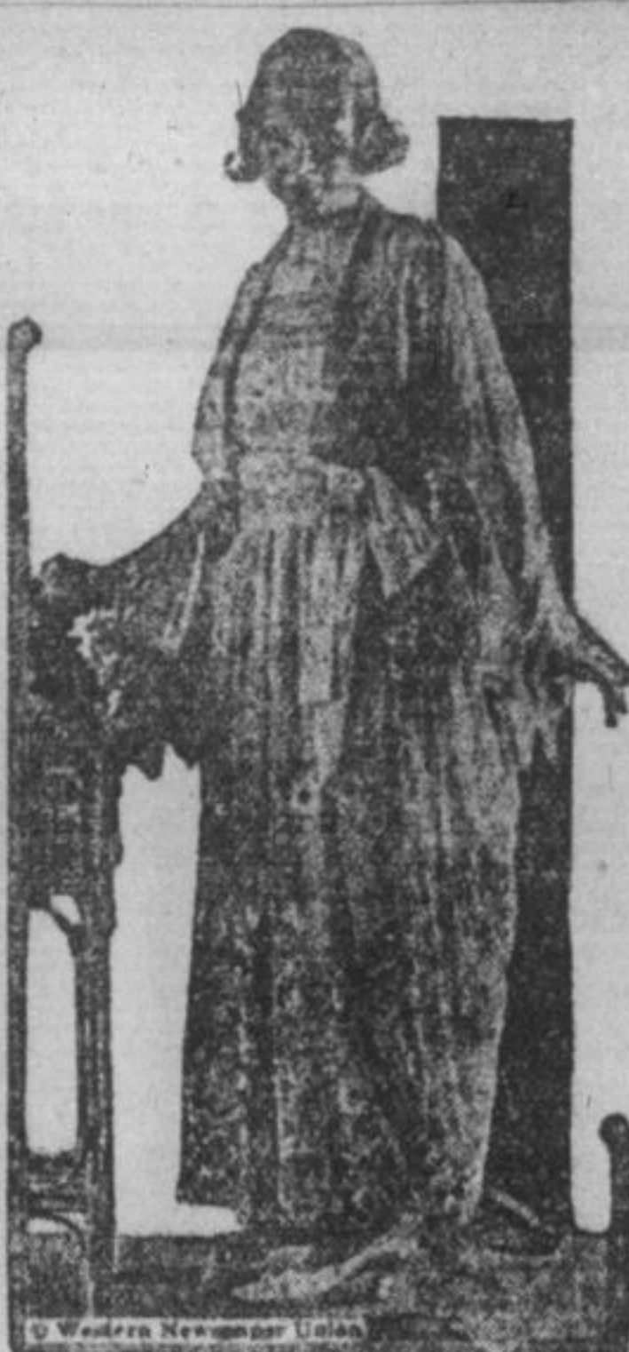
FOR AFTERNOON WEAR. Dress of cream georgette over flesh crepe de chine. Lace and delicately tinted ribbons make this charming.

in outline and embroidered with claret colored bugle beads. The sash, which is really a continuation of the long bodice, has its ends fringed with deep red bugles. Evening dresses still have very little in the way of bodices. Black satin skirts topped only by bright colored sashes produce some of the new dance frocks. From the house of Brandt in Paris comes such a dance frock. It is simply a black satin skirt attached to a sash. The long, slender train is made of ribbon. A vivid bit of color is introduced by having the sash corsage and train of orchid pink satin ribbon. The ribbon used for the train is very much narrower than that which forms the sash bodice. The shoulder straps are of jet beads. Slippers of orchid pink satin with stockings to match are worn with this frock. Autumn hats are neither large nor small but of medium size. The Chinese hats are conspicuous in them.