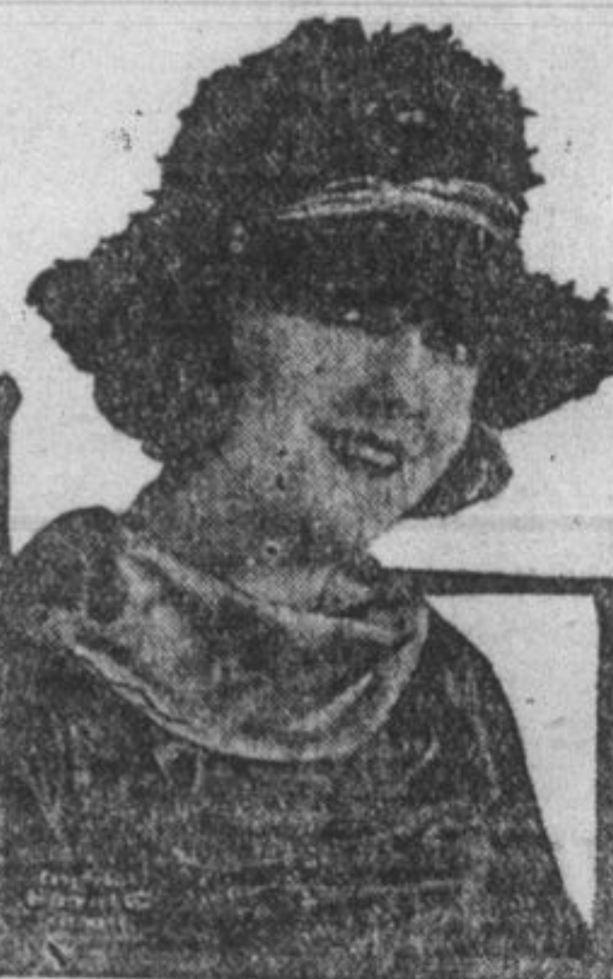
BROWN VELVET HAT. A brown velvet hat flecked with small loops of henna chenille.

The long-waisted bodice appears in almost all of these models. A black taffeta day gown featuring such a bodice and the fluted tunic is sketched today. The half low neck is round