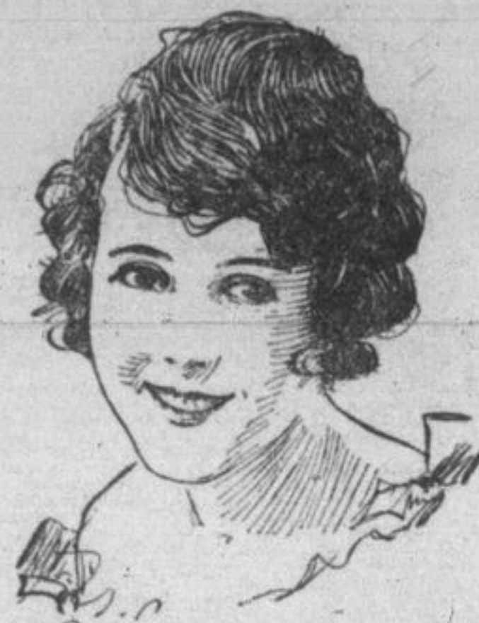
They Keep Teeth White By keeping them free from film. The old ways failed to do that.

Make the test this week, while the 10-Day Tube is free. The result will be of lifetime importance to you. Cut out the coupon so you won't forget.