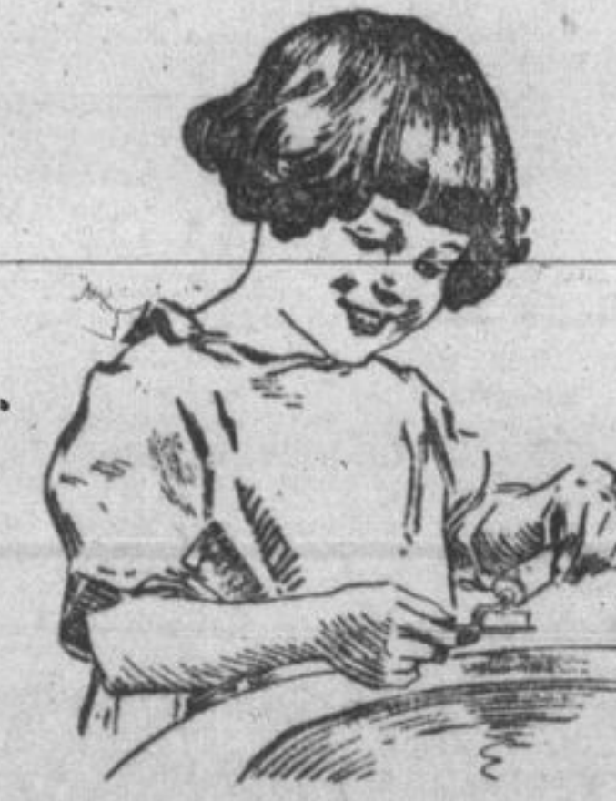
They Teach Children How to really clean teeth, and how to combat the film which is the source of most tooth troubles.