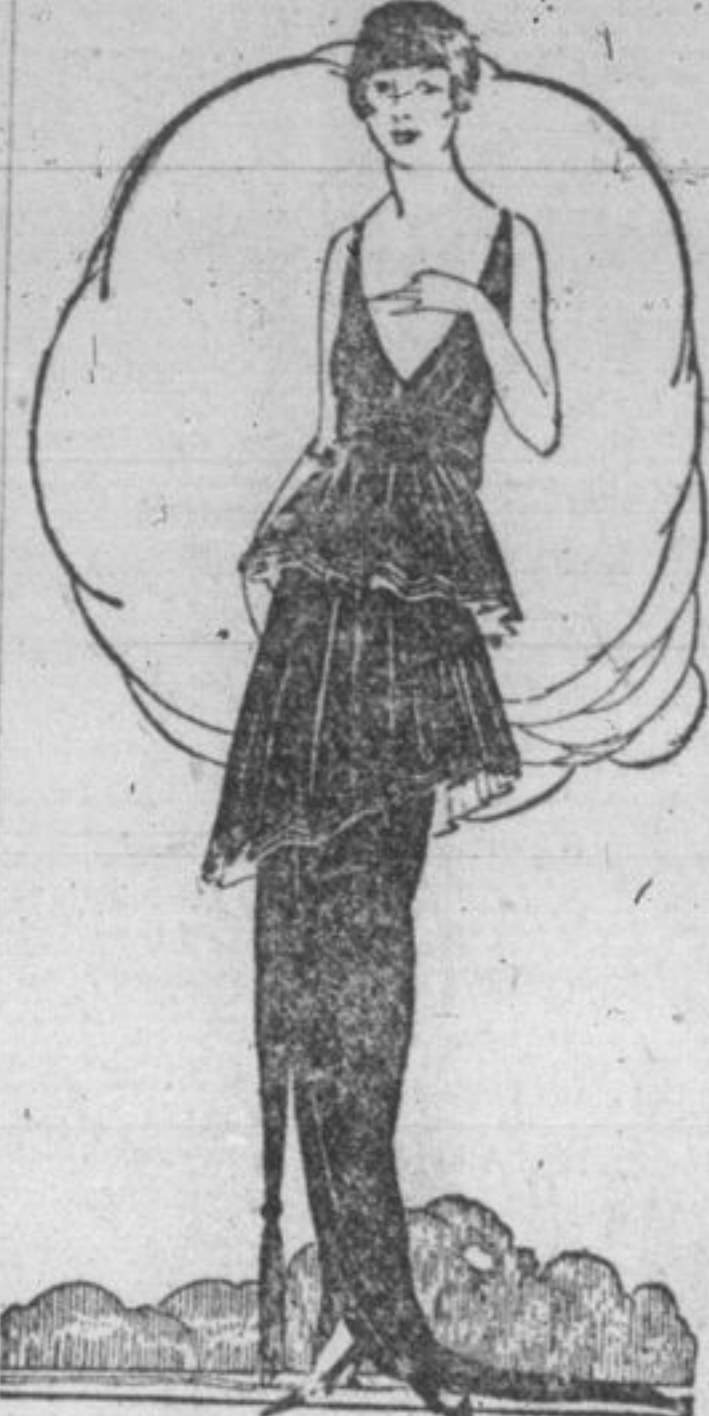
Black and Gold Lace Evening Gown With the Prevailing Tunics.

A beautiful black and gold evening gown is taken out of all sombreness