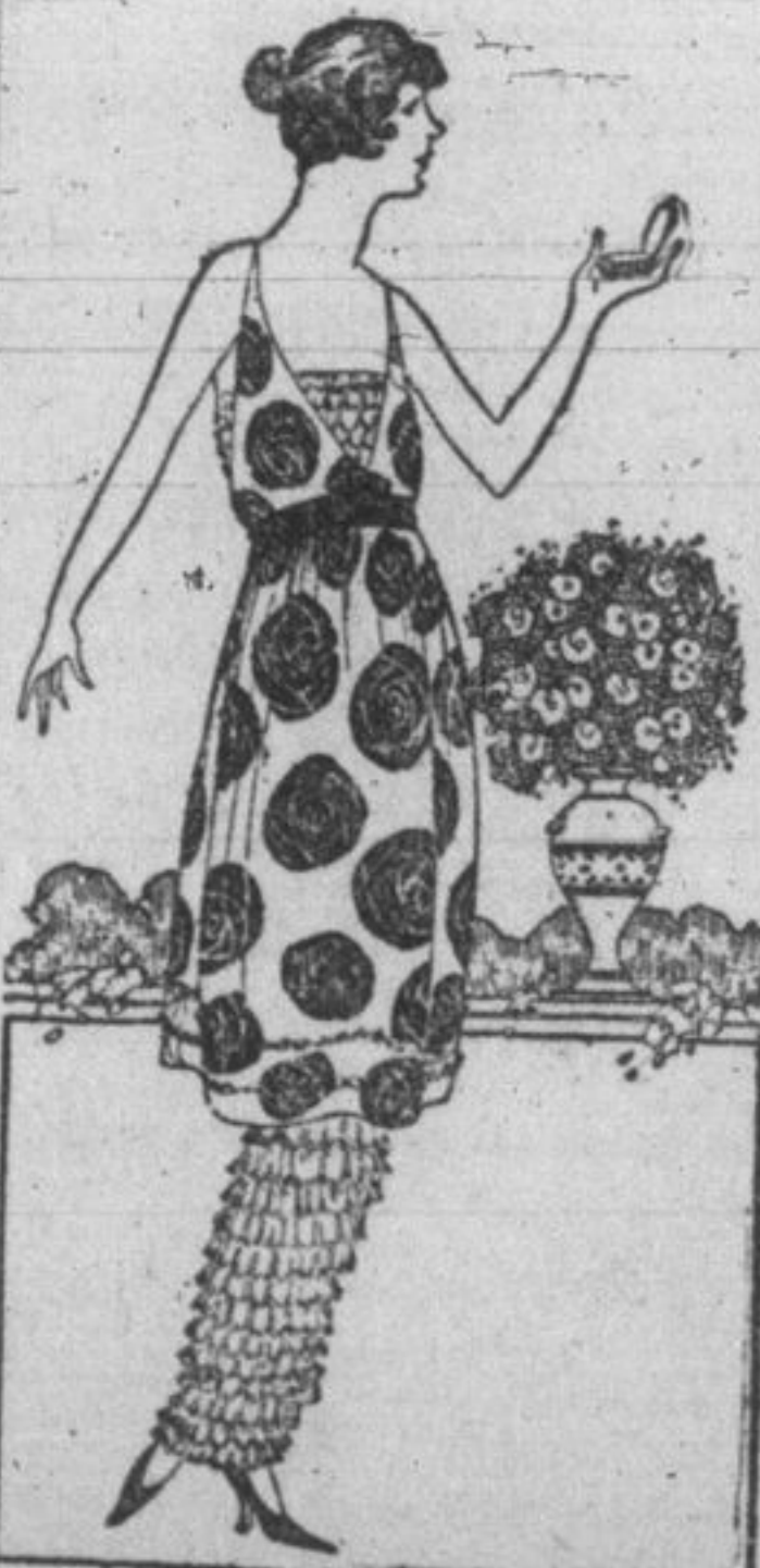
Gown of White Taffeta With Design of Pink Roses.

These wraps are frequently yoked in the drop shoulder line and the silhouette suggests the old-fashioned dolman, which lends itself perfectly to these modern capes. Crystal tas-