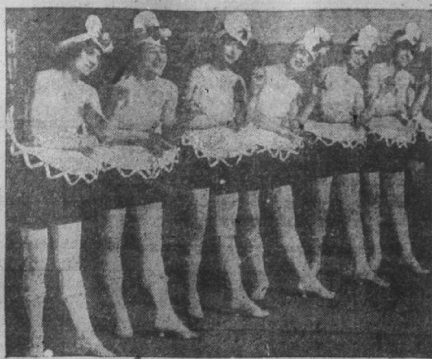
Some of the "Pony" ballet with the musical novelty "My Soldier Girl," coming to the Grand Opera House, two days, Friday and Saturday, Sept. 19-20th with a Saturday matinee.