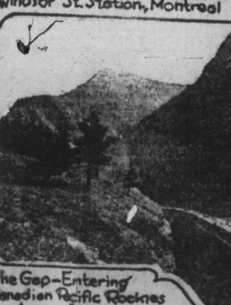
The Gap—Entering Canadian Pacific Rockies

Now that the era of reconstruction is here, the business man, who has been taxed to the limit, bought bonds to his capacity and given until it hurts to be considered again. He is to be permitted to get from place to place quickly and he is to be given every assistance to revitalize the business of America. The railways are the veins and arteries upon which a healthy business body must depend, therefore normally much of his help must come from them. The Canadian Pacific, a privately run road is the first of the railroads to help the business man. On June 1st, the first "Trans-