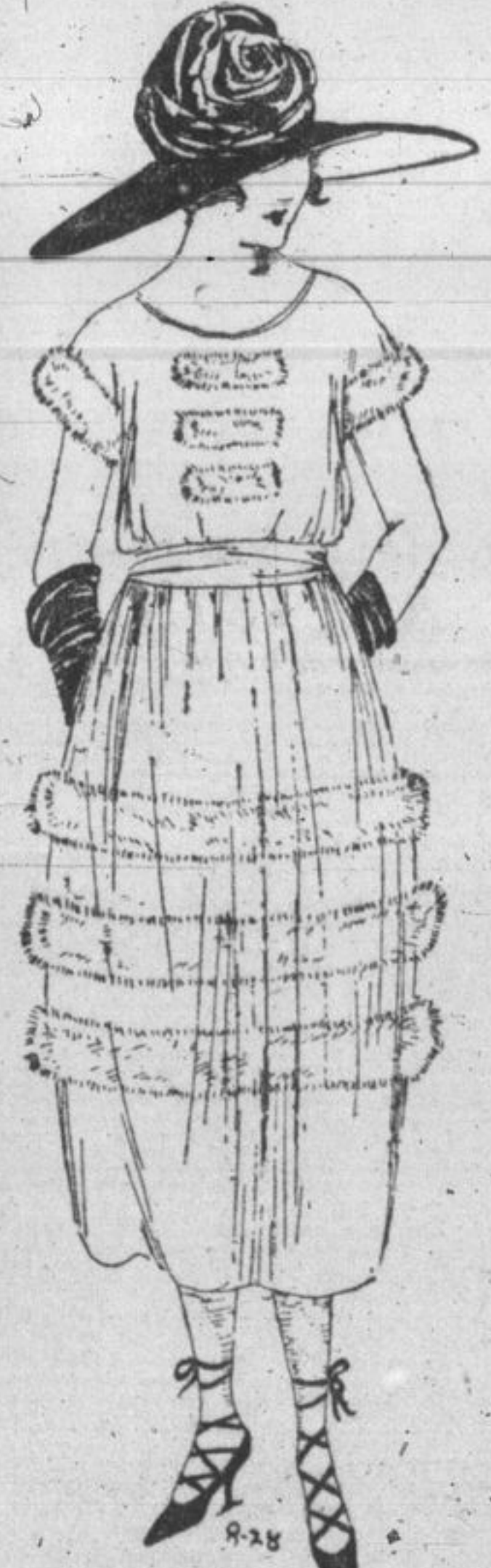
Citron colored voile frock trimmed with bands of cotton swans' down.

Paris rarely puts collars on any of her necklines, but the American and English carry out their own ideas here. They add the band of white, in embroidered batiste, organdie or net. Of one thing we may be grateful: there is a blessed absence of fringe on these pleated models. Nothing dangles from the edge. The sharply cut hem stands out in a bold relief from the ragged and untidy edges of the rest of the summer frocks.