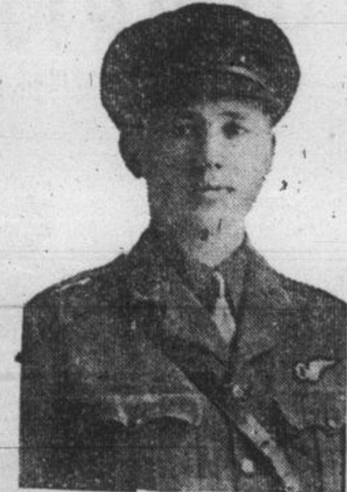
LIEUT.-COL. W. G. BARKER, V.C. Famous Canadian aviator, who, dying a captured German flogger machine, was first to complete the round trip from Toronto to New York and return in the international air derby on Wednesday morning.

It has been suggested by some of the Bay residents that these men take part in the home-coming celebration for the soldiers, sailors and marines, which will be held on Sept. 9th, representing the nation's chief executive and his assistant and the nation's greatest soldier extending the glad hand to the boys, and if they are willing to take the part, there is a good likelihood that their act will be one of the features of the day.