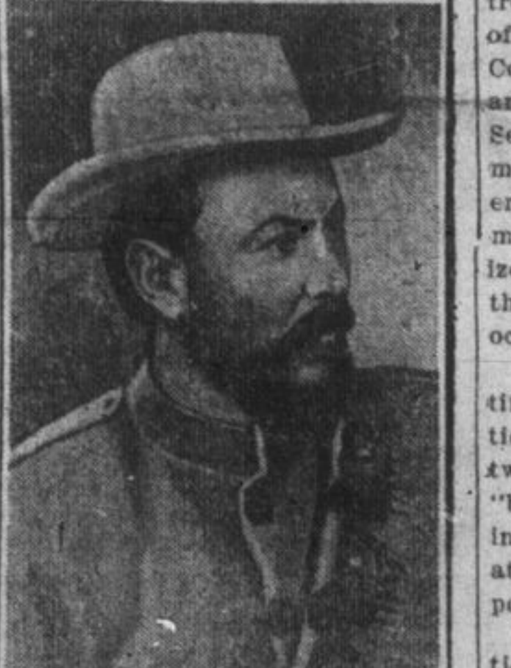
GEN. LOUIS BOTHA Pretoria, Aug. 28.—Gen. Louis Botha, Premier and Minister of Agriculture in the Union of South Africa, died suddenly early this morning following an attack of influenza. He was born in Graytown, Natal, 1863.

South African Premier Passed Away Suddenly in Pretoria.