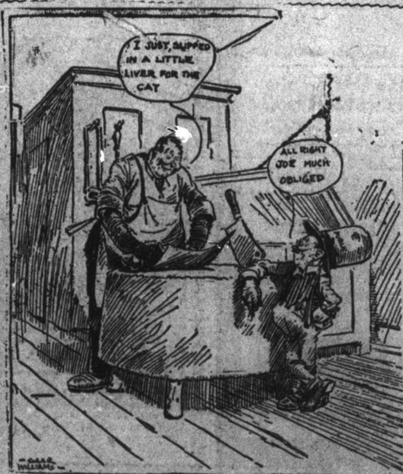
A FELLER WE USED TO KNOW.

Three persons were killed and a fourth badly injured when an automobile went over a high embankment near Lake Placid, N.Y., on Thursday.