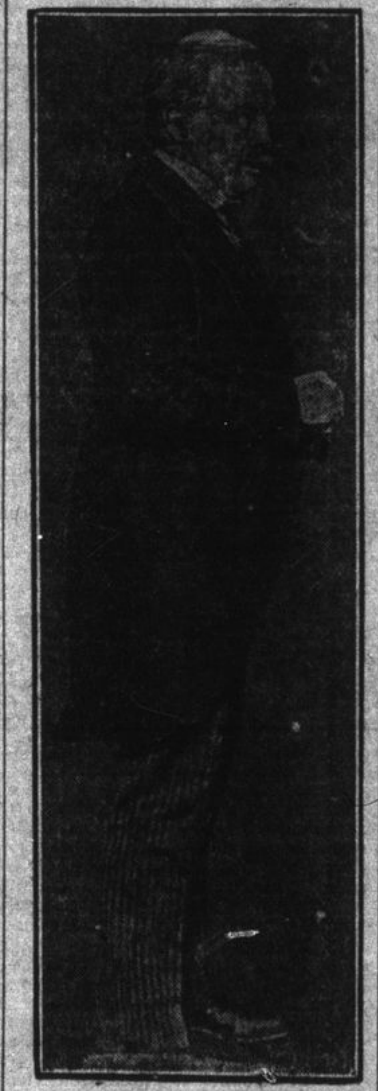
PREMIER LLOYD GEORGE

In a letter to the premier, dated Buckingham Palace, August 6th, announcing the award, the king says: "My Dear Prime Minister: Honors and rewards to officers of the army, navy and air force having been submitted to parliament, I feel that my people will share with me regret that it is not possible to express the