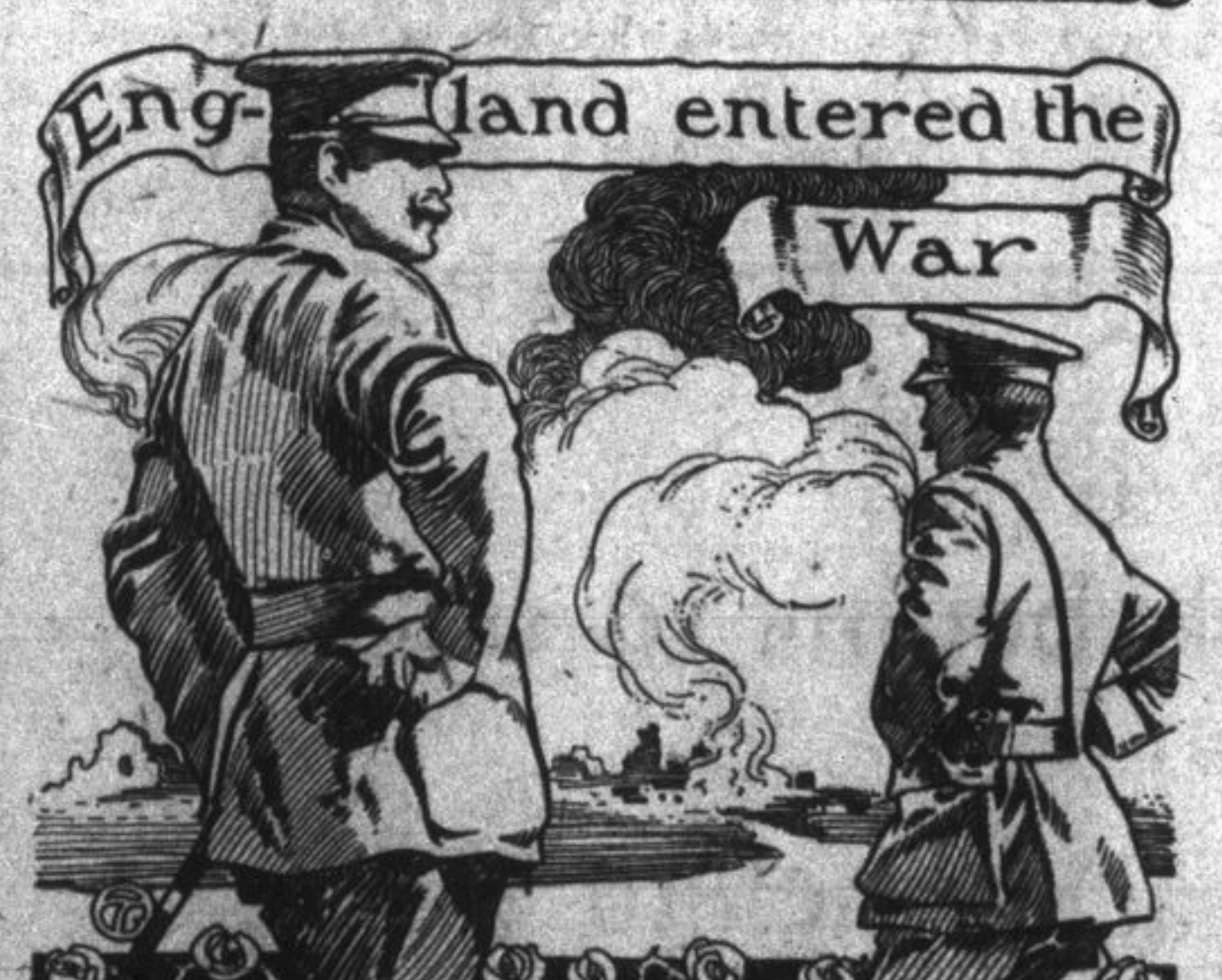
Five years ago today, August 4, 1914, England declared war against Germany. Find two Germans. Answer to Saturday's puzzle. Upside down, nose at shoulder of center man.