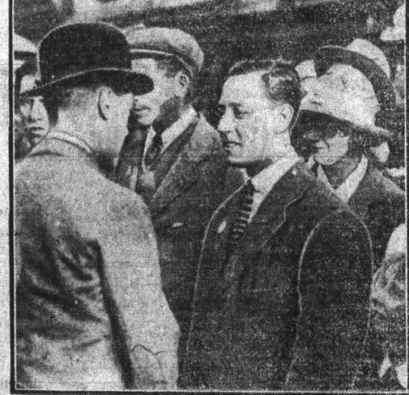
THE PRINCE OF WALES IN DEVONSHIRE. Recently the Prince has been paying a visit to Devon and Cornwall.