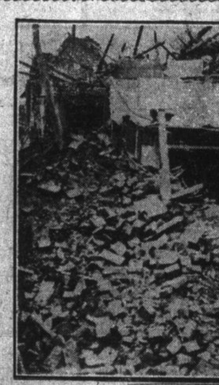
FIRST "HOME" BUILT IN THE RUINED CITY OF LENS. The citizens of Lens are beginning to return to the sites of their former homes, penniless and forced to make what they bravely try to call a "home" from the scattered debris.

Discovery of Quebec, July 3, 1609. It is just three hundred and eleven years ago to-day since Samuel de Champlain, the famous French explorer, and the first governor of French Canada, sailed up the St. Lawrence and fixed the site of the city of Quebec.