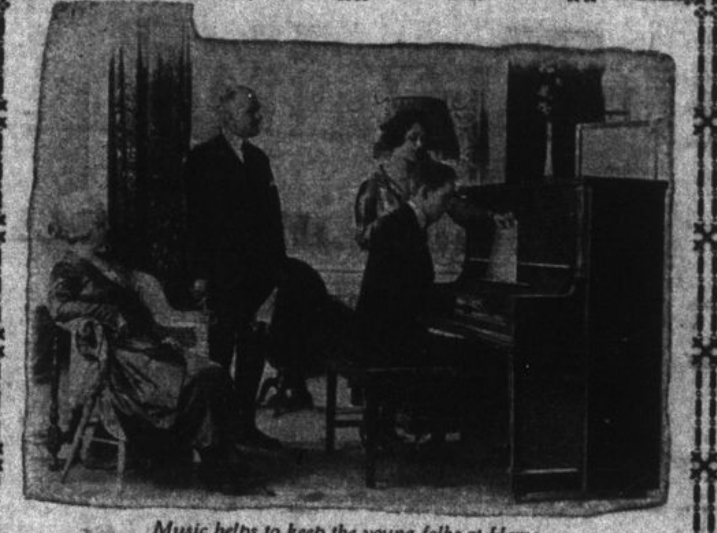
Music helps to keep the young folks at home