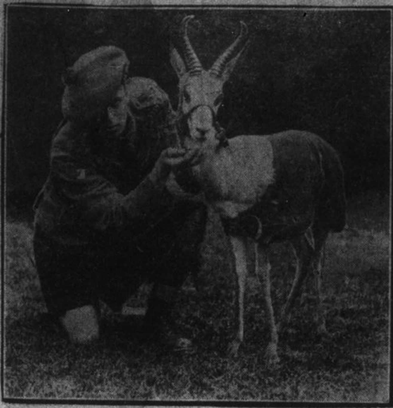
Springbox, mascot of the South African troops, which marched with them in the big parade of Colonial troops in London on May 3rd.