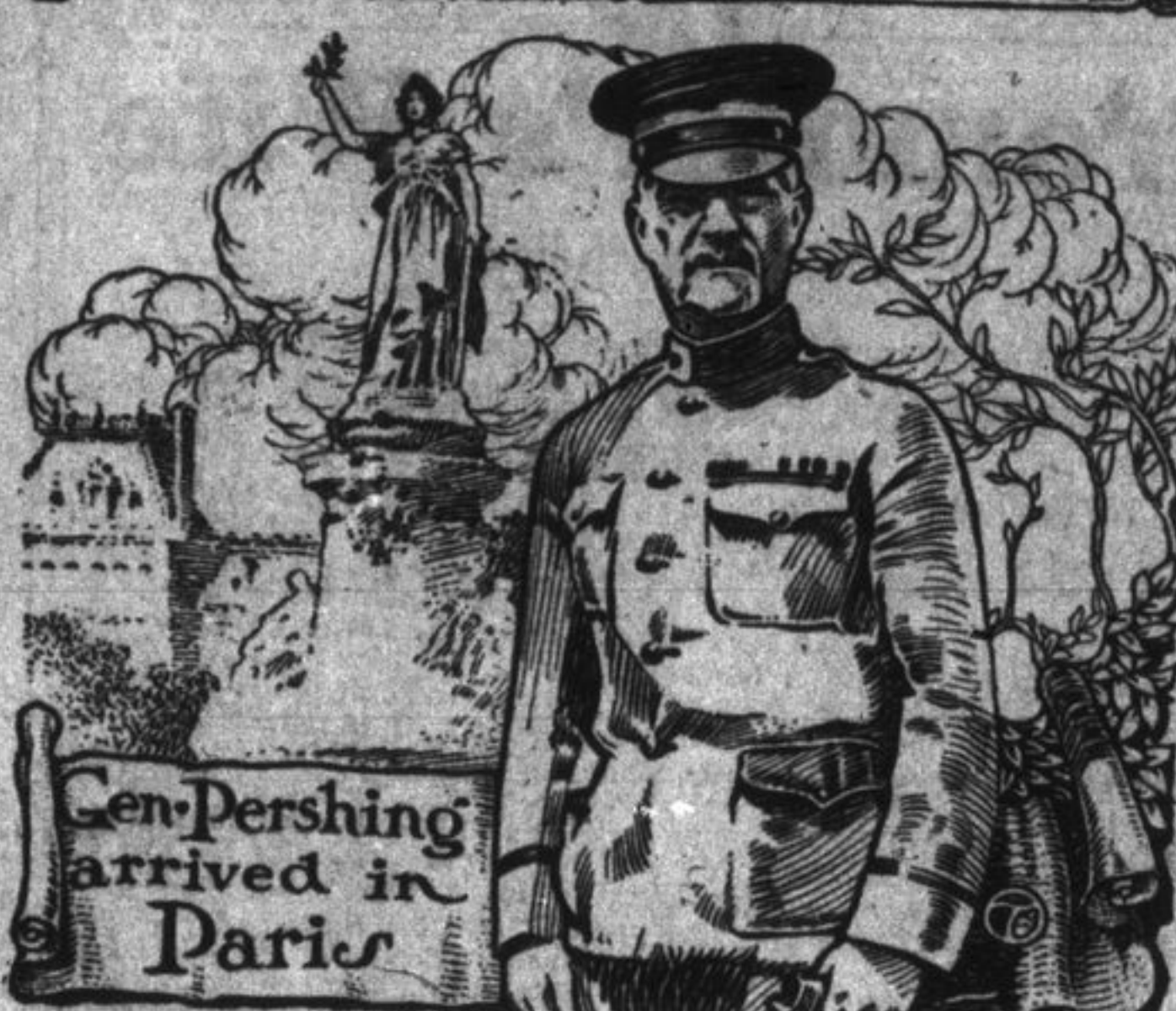
Two years ago today, June 13, 1917, General Pershing arrived in Paris. Find a Hun. ANSWER TO YESTERDAY'S PUZZLE German--left side down helmet in left arm. Turk--left side down among ruins.