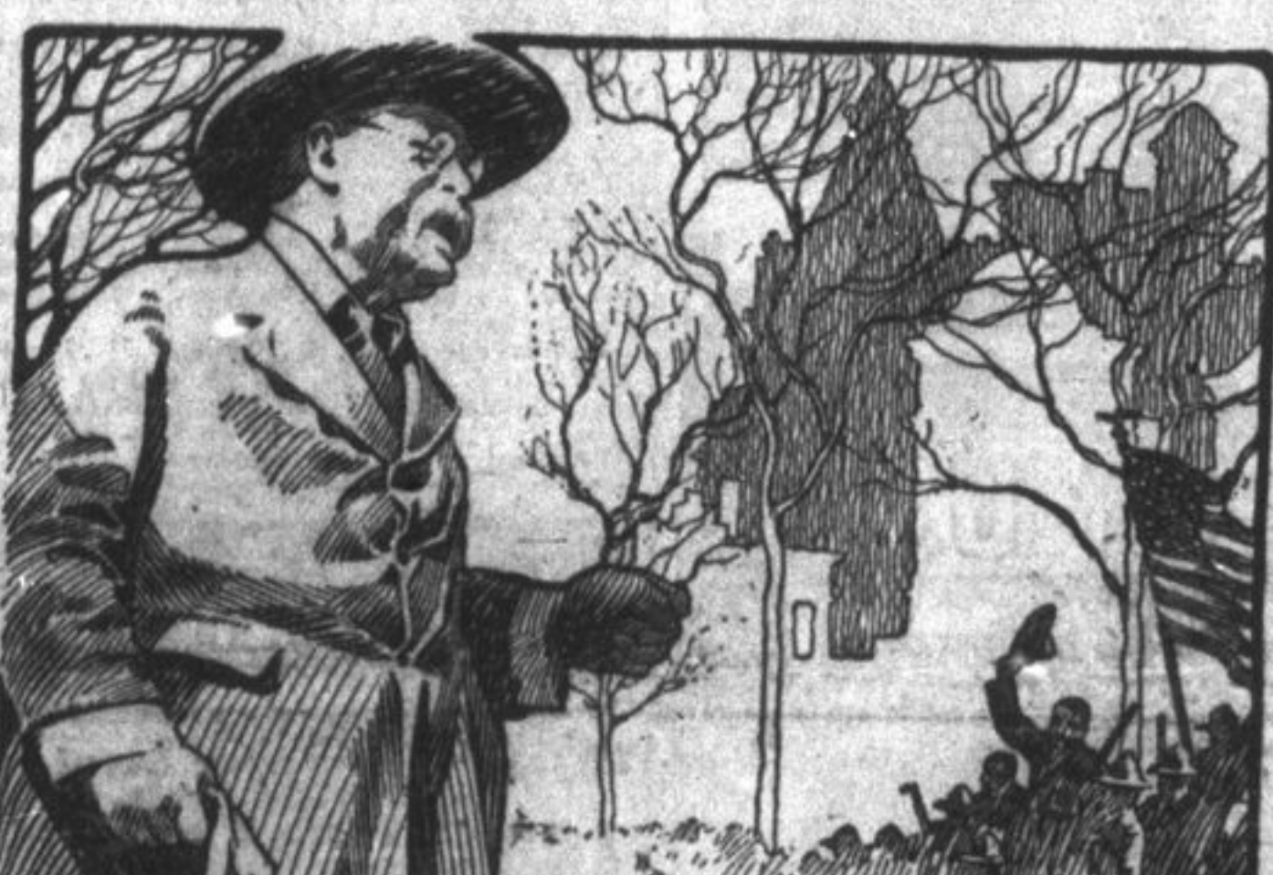
Col. ROOSEVELT disbanded his volunteer division

Two years ago today, May 20, 1917, Col. Roosevelt disbanded his volunteer division. Find a rough rider. ANSWER TO YESTERDAY'S PUZZLE Right side down, nose at left shoulder.