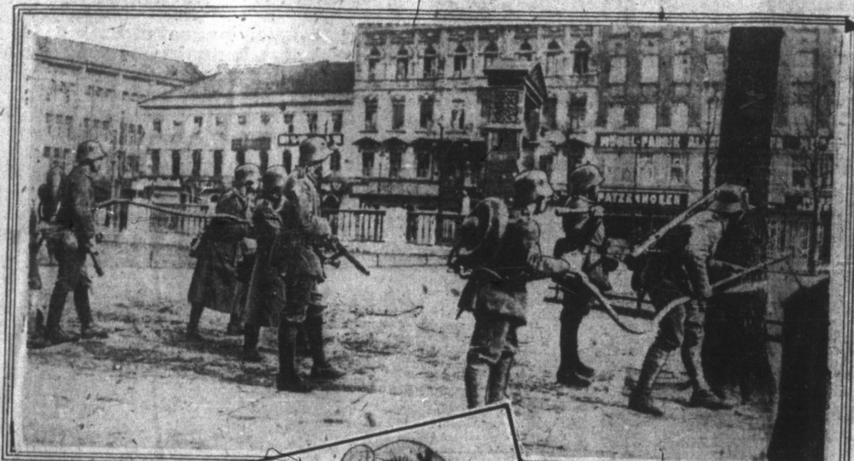
Government Troops in the Streets of Berlin Protecting the Under-Grounds with Liquid, Fire and Grenades.

REMARKABLE PHOTOS TAKEN IN BERLIN STREETS DURING CLASH BETWEEN GOVERNMENT AND BOLSHEVISTS.