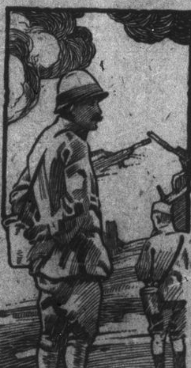
FRENCH ADVANCED Along 11 mile front near Rheims and took 3,500 prisoners, two years ago today, April 17, 1917. Find a prisoner. YESTERDAY'S ANSWER Right side down in flames.