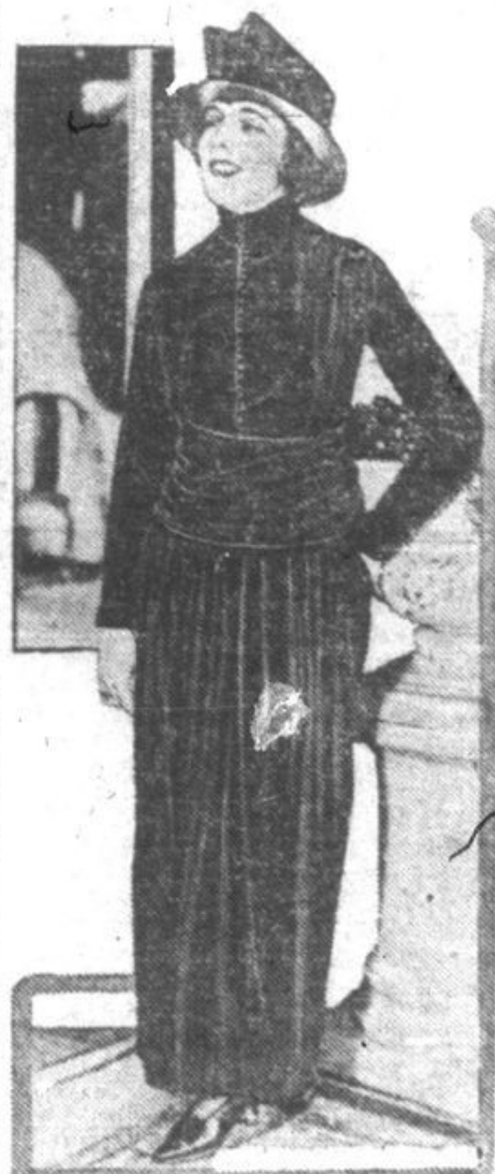
The charming afternoon gown of navy blue velvet comes from Lady Duff Gordon. It is fastened high at the neck with an interesting array of steel buttons on the waist and the sleeves.