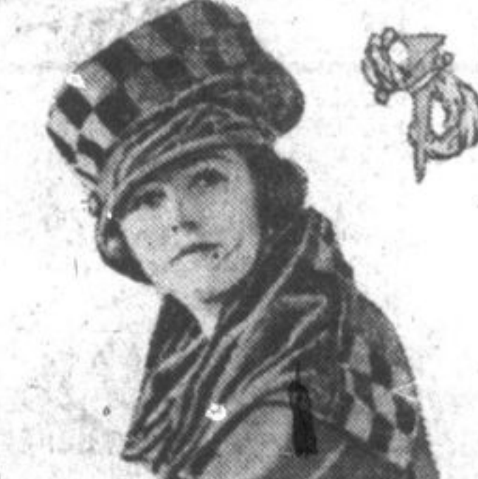
This smart hat and scarf set is in mauve velvet. Gray and yellow checked velvet forms a striking trimming.