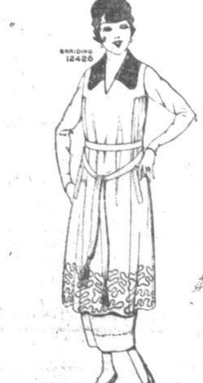
Overdress in Broadcloth.

An all-day frock, to answer all of the demands made upon it, should be smart, simple and serviceable. The model shown here lends itself to two forms of treatment as regards sleeves and trimming. A flare finish may be given to the sleeves, or they may be stitched in close effect to the wrists, and for the lower edge of the overdress, either soutache braid or fur may be used as a trimming. The overdress is made with a yoke that descends into a panel front and back. It is in redingote style, mounted on a satin foundation that consists of a back-clothing underbody joined to a two-piece skirt that is gathered at the back and closes at the center-back.