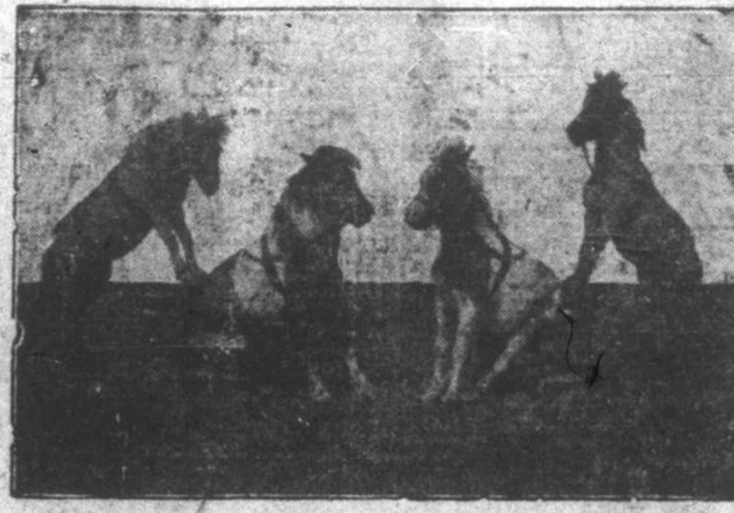
Group of animals with Berzai's Circus at the Grand Opera House for two days commencing Tuesday with a matinee daily.