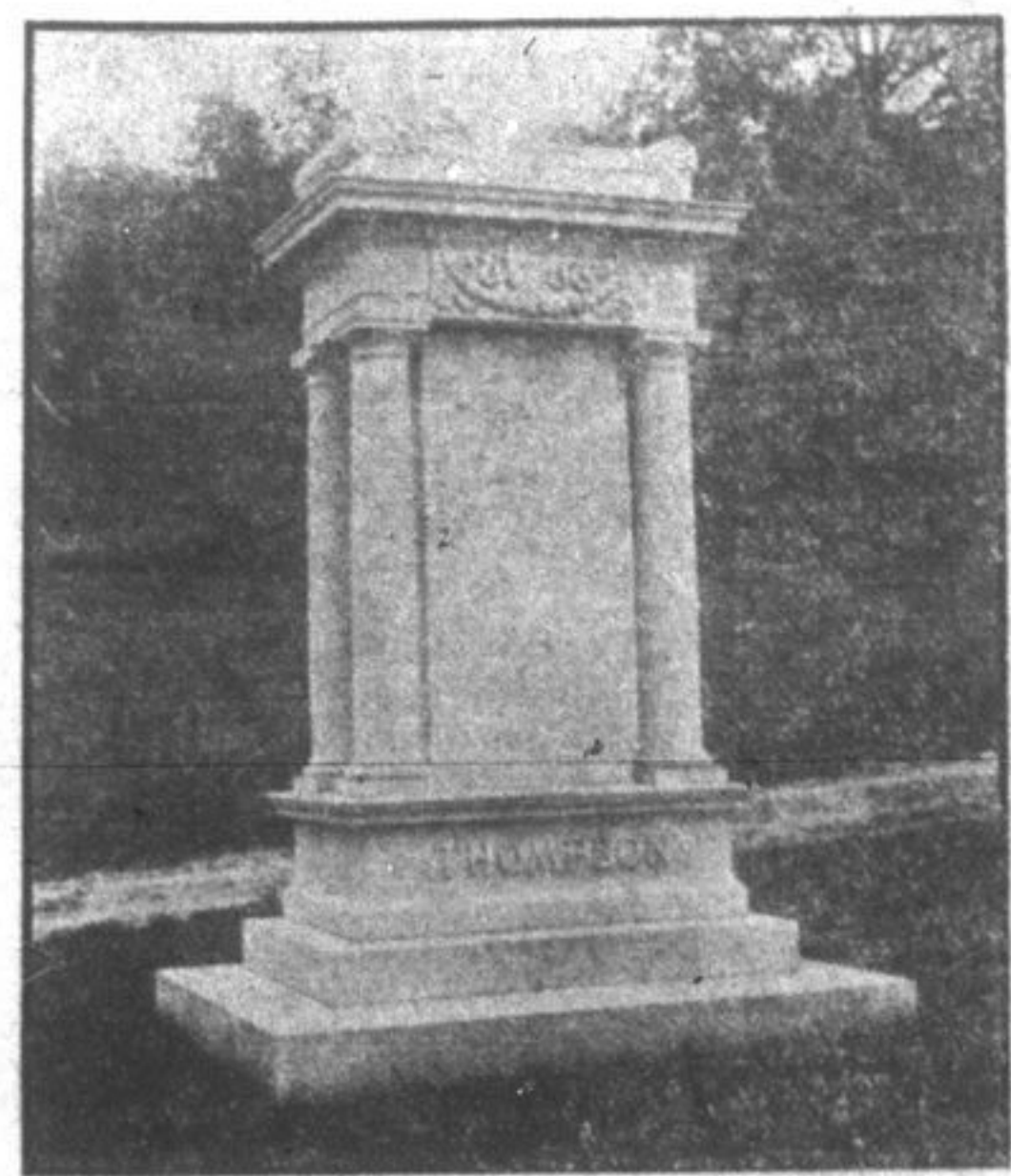
High Grade Memorial Monuments Information On Request.

The McCALLUM GRANITE CO., LTD. Phone 1831, Kingston, Ont. 307 Princess Street.