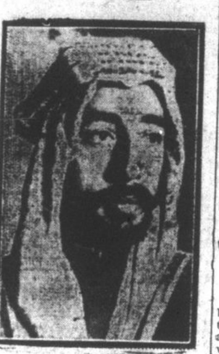
EMIR FEISAL. Son of the King of the Hedjaz, the picturesque figure at the Peace Conference.