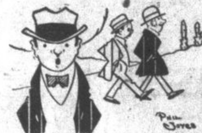
NOT CARRYING THEM

"Did you stay long in New York?" "No, I got short very quickly."