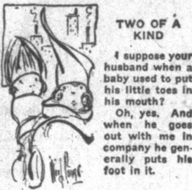
TWO OF A KIND

"Don't you believe that you are the only girl I have ever loved?" "Yes, I have heard that you are rather eccentric."