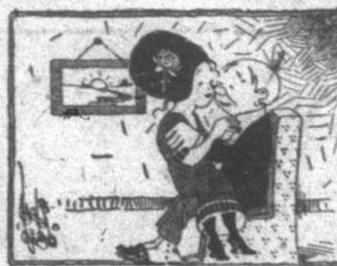
A PECULIAR FELLOW

"Well, son, I see you're back from the front and not a scratch." "No, I quit scratchin' as soon as we got out of the trenches."