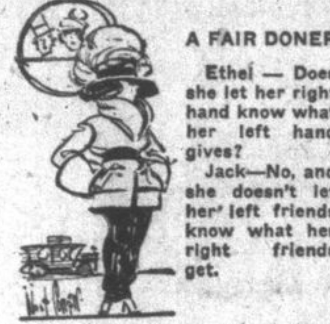
A FAIR DONER

I suppose your husband when a baby used to put his little toes in his mouth? Oh, yes. And when he goes out with me in company he generally puts his foot in it.