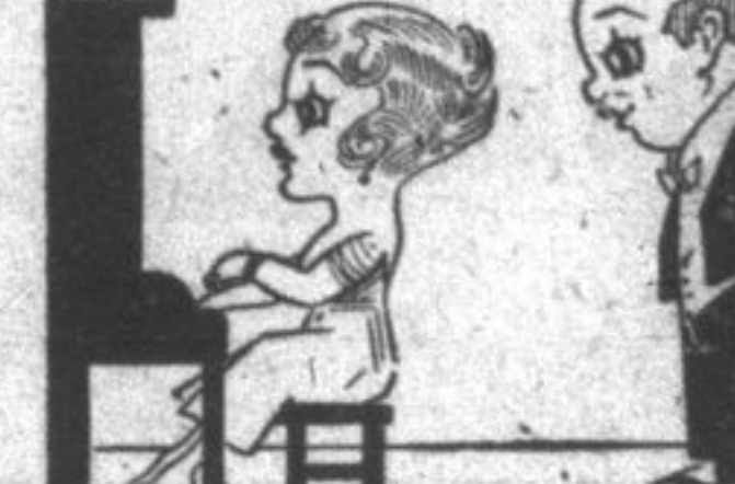
POOR OLD TIME

"Did Bill inherit his father's brains?" "If he did they must be held in trust by somebody."