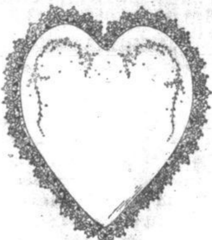
No. 12410—Heart-Shaped Pillow.

Pictorial Review patterns on sale at local agents.