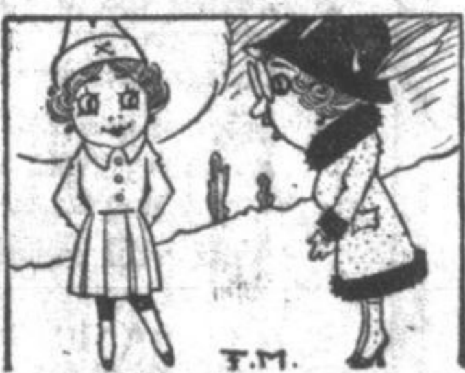
SAFETY IN NUMBERS

Eight hundred women clerks employed by the Bank of England as a war measure have been notified that their services will no longer be required, but that 200 of them may make special application for as many permanent positions in the clerical staff. The salary will be $15 a week, with a pension of half that amount after 25 years' service.