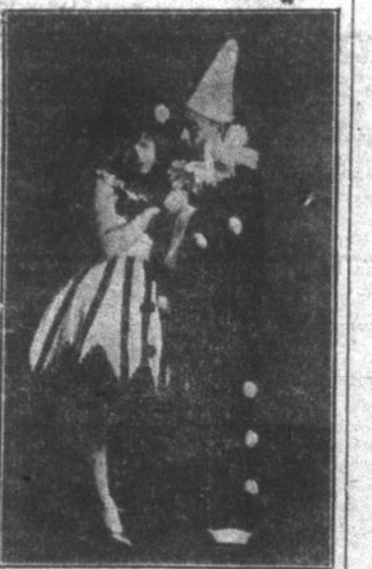
One of the many charming scenes from "The Pirot Players" at the Grand on Friday and Saturday with a matinee on Saturday.

We have supported with our full strength all Government war loans; the Canadian Patriotic Fund; General Relief Funds, including the Belgian Relief Fund to which we specially devoted our attention; hospital and regimental funds and numerous other public undertakings, subscribing to several from our Board Funds.