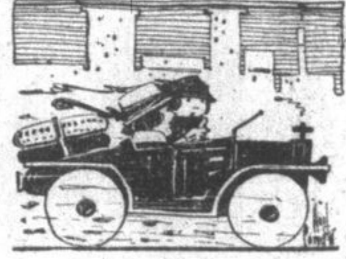
TO BEGIN ON

Mrs. Bug—My I am glad I married Mr. Spider. He can carry so many bundles, when I do my shopping.