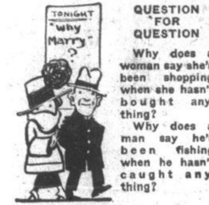
QUESTION FOR QUESTION

I've never seen a decent Hun. I don't expect to see one, For Judging from the things he's done I'm sure there cannot be one.