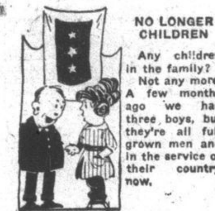
NO LONGER CHILDREN

Why does a woman say she's been shopping when she hasn't bought anything? Why does a man say he's been fishing when he hasn't caught anything?