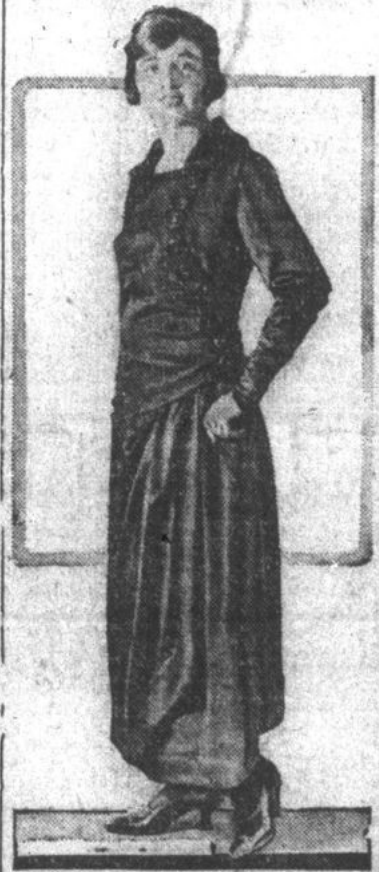
The basque has reappeared. Here is an interesting illustration of its use in an afternoon gown of bronze satin crepe. The side opening is an attractive feature, and the oddly cut buttons with the finishing touch of mole at the neck add to its beauty.