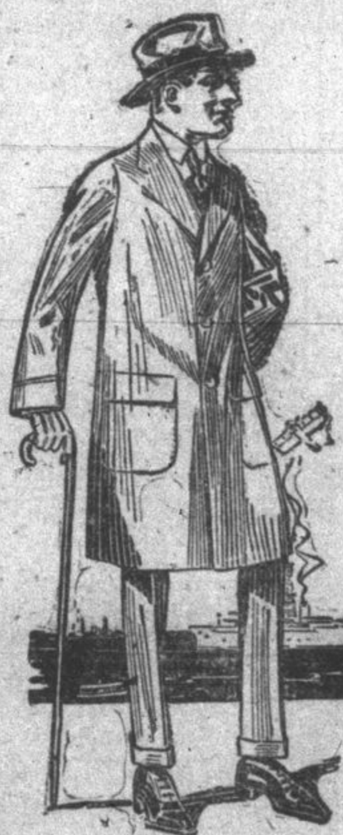
Society Brand Clothes

THE TRENCH STYLE Belted all round Scotch tweeds, new three-way collar. Extra special value, $28.50.