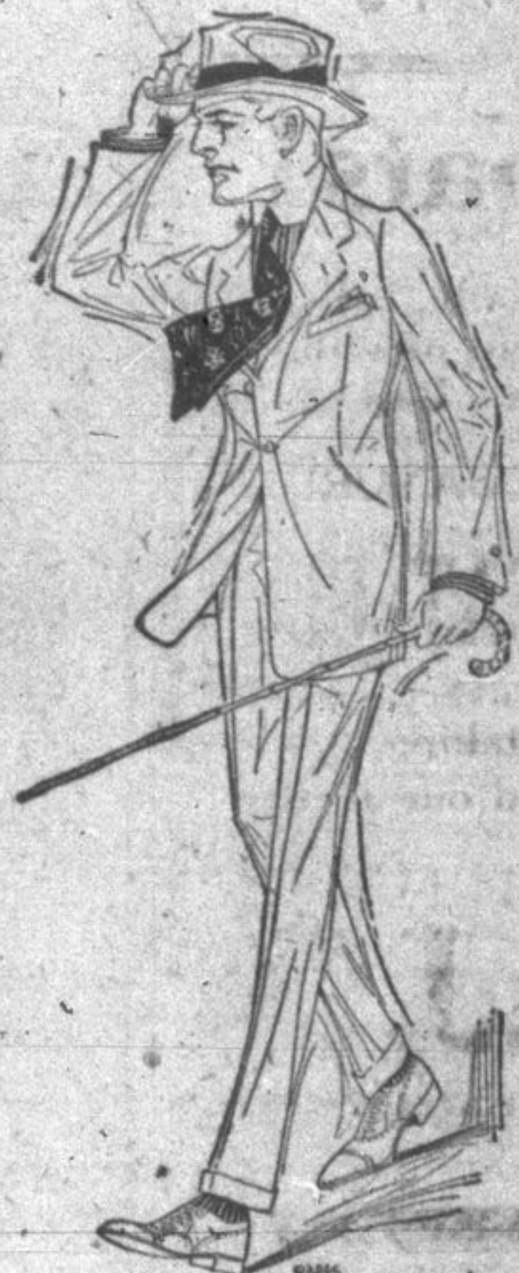
Society Brand Clothes

THE BUD SUIT Scotch and English tweeds and worsted; neat plaids, pencil stripes and overplaids. Extra special $35.